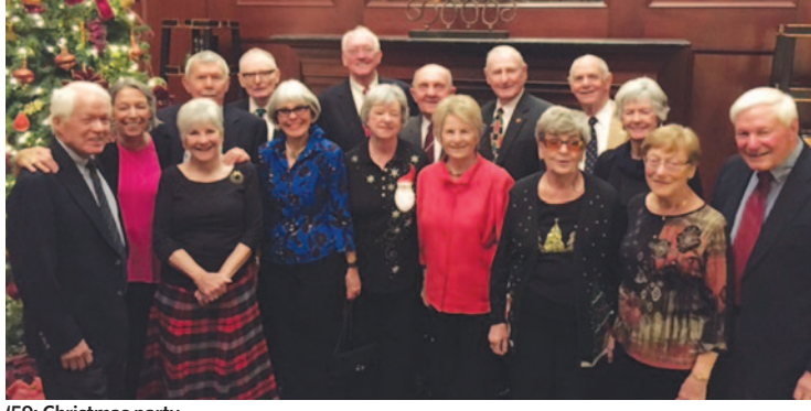
'59: Christmas party