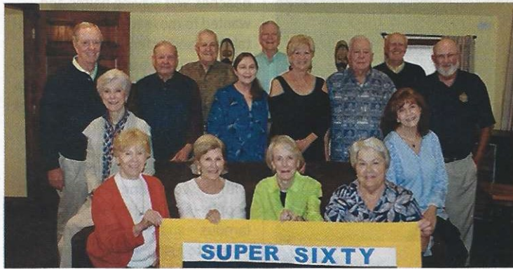
'60: Outer Banks group