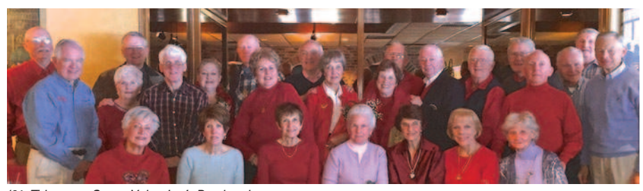
'61: Tidewater Group Valentine's Day lunch