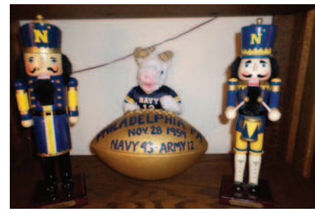
Memories of Army Navy victory