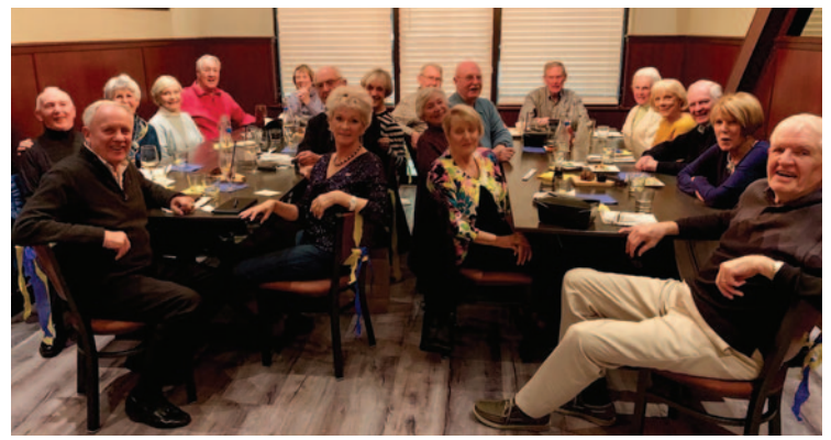
'61: Celebrate the arrival of Spring in VIrginia Beach, VA