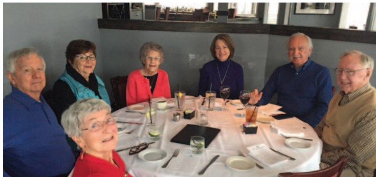
'60: Annapolis group