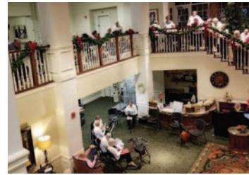
Christmas celebrations at Oak Hammond. Carol is with the choir on the 2nd floor, preparing to sing carols.

To request info or apply online, visit usna.edu/Admissions