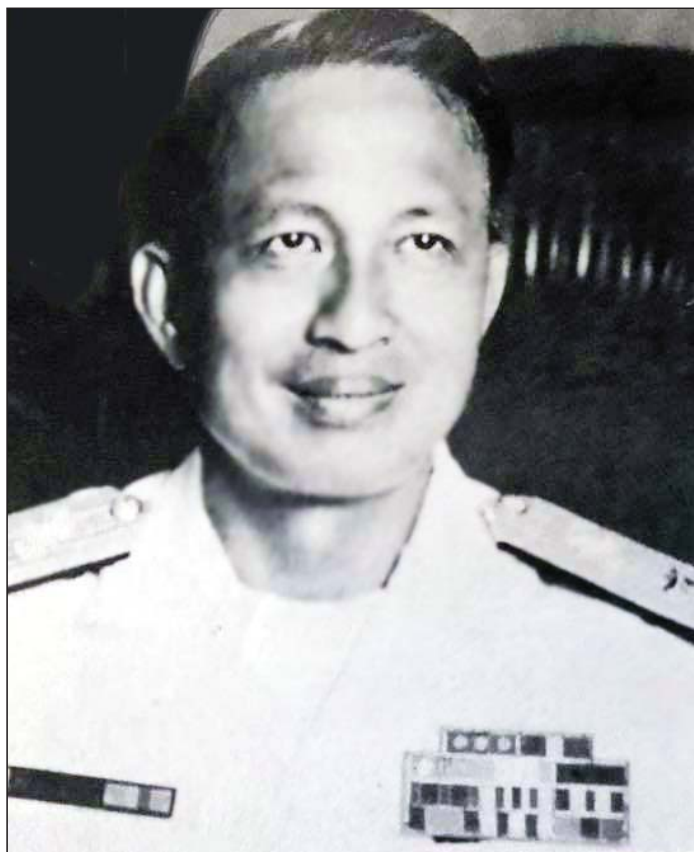
Commo CARLOS L AGUSTIN AFP (Ret), RIP Dec 13, 1937 - Apr 12, 2020

Commodore Agustin was later appointed President of the National Defense College of the Philippines (NDCP) (2001-2010). He was also one of 5 Philippine Experts and Eminent Persons in the ASEAN Regional Forum (ARF EEP) (2002-2012), and continued his Track 2 engagement in Confidence Building with Chinese think tanks through the Philippine Council for