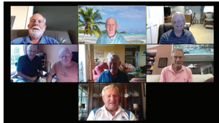
'61: August luncheon

The best page on their site is the FAQ one that provides information