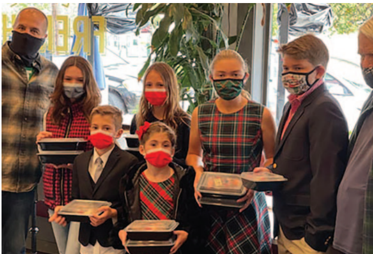
'60: Old Goats Kids Who Care

Happy New Year, the Old Goats Kids Who Care team.