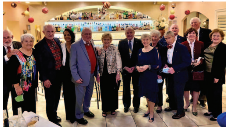
'60: Christmas Party in Tidewater

The Old Goats Kids Who Care project which kicked off a few weeks ago now has 97 host sponsors who have directed over $10,000 in business to our participating local restaurants. We intend to keep going as long as we can make a difference and really appreciate your support.