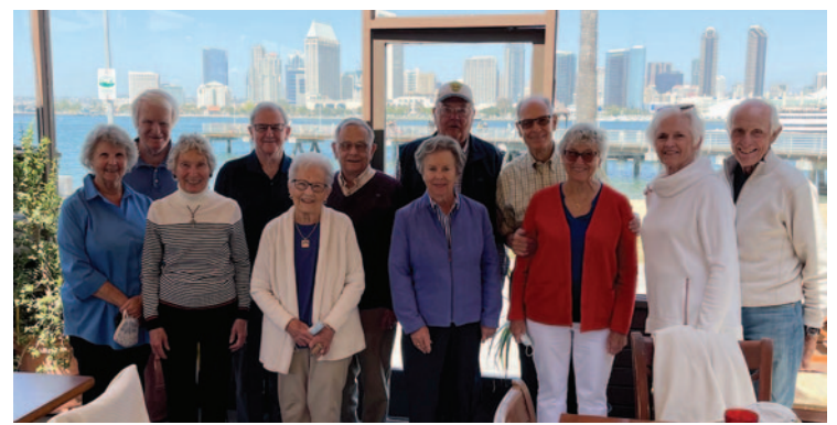
'60: SOCAL group in Coronado

■ The DC Lunch Group's first p ost-Covid gathering took place at the Army-Navy Country Club in