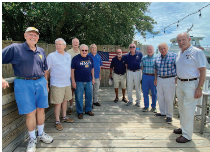
'60: DC Group