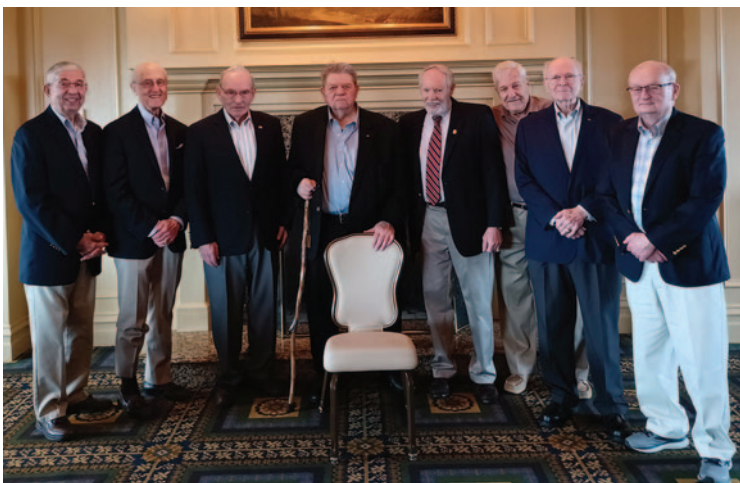
'60: Tidewater Group