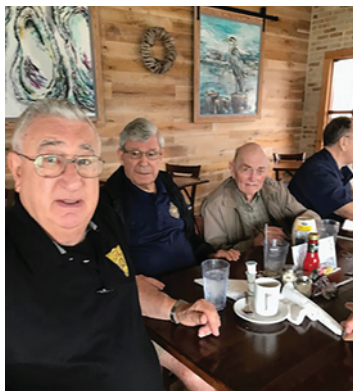
Ianucci & Tidewater group