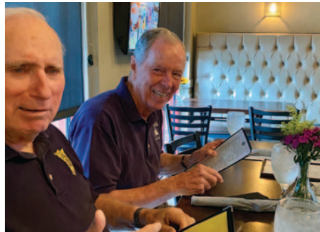
Bissell & Parcels