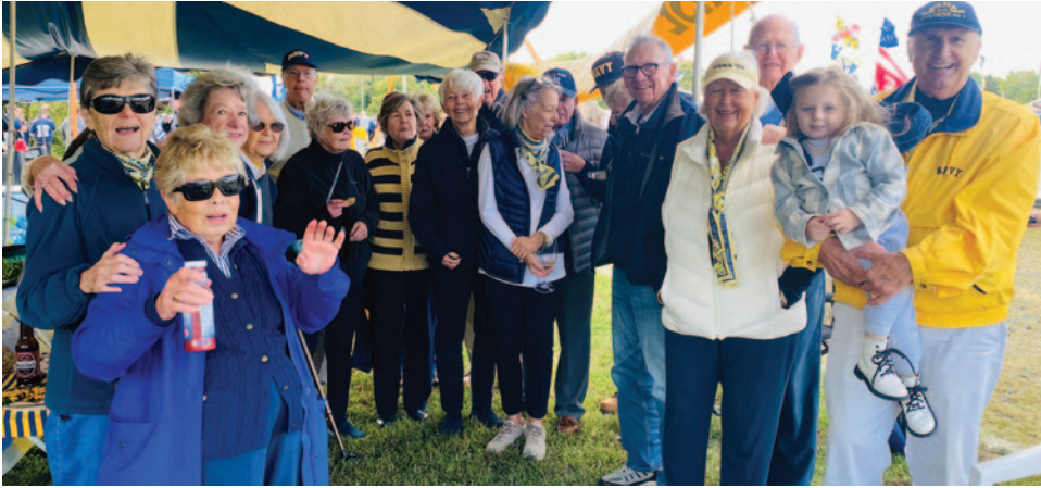
'59: At the Tulsa game

know the whereabouts of any of these classmates who I can contact for possible future reunions. We had many laughs, fun stories and fond remembrances which made this reunion a warm and heartfelt gathering of four classmates and teammates from a long time ago.