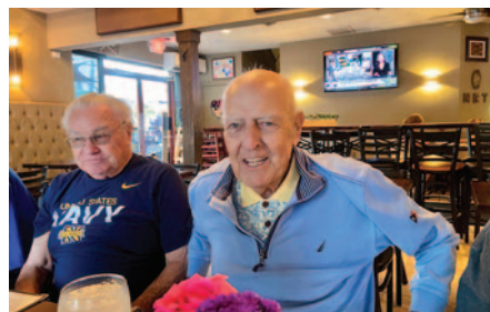
Key & Clextion