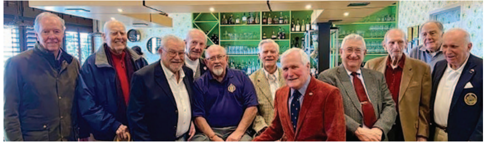
'60: Tidewater Valentines group